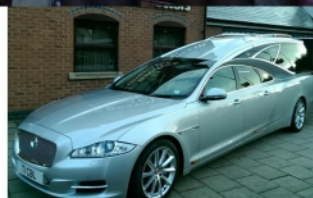
Our Silver fleet of Jaguars

112, Church Road, Yardley. B25 8UX (On Yew Tree Island) 0121 784 3230