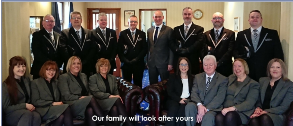
Our family will look after yours

Our dedicated full time staff will guide you through the arrangements to ensure a unique and a befitting funeral.