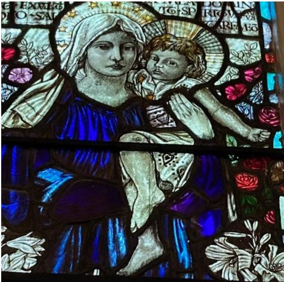
Detail from East Window in Upper St. Alphege Chapel