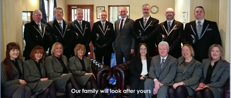
Our family will look after yours

Our dedicated full time staff will guide you through the arrangements to ensure a unique a befitting funeral.