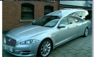
Our Silver fleet of Jaguars

112, Church Road, Yardley. B25 8UX (On Yew Tree Island) 0121 784 3230